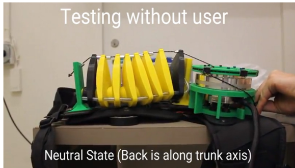
Figure 5. Exoskeleton in neutral state

extension. The motor successfully pulled the artificial spine upwards and normal to the user's back.