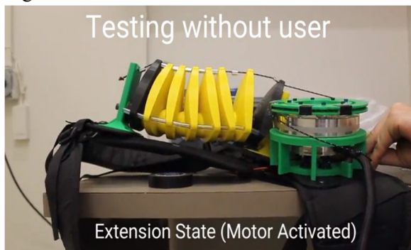
Figure 6. Exoskeleton with motor engaged.

With the user, a box weighing approximately 40 pounds was lifted.