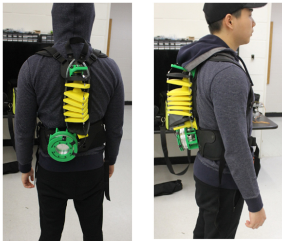
Figure 3. Full assembly of exoskeleton Our exoskeleton is inspired by semi-rigid structures found in nature such as elephant

The device's components consist of one top fixture, one bottom fixture, eight disc-ball-disc joints, cables, motor, motor housing, and a pulley. For comfort and convenience, the exoskeleton is attached to an off-the-shelf harness vest as shown in Figure 3.